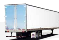
DRY VAN 4000D-X COMPOSITE