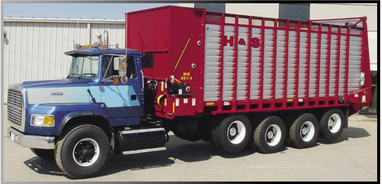
Aluminized front & rear unload industrial box with optional grain hopper, front enclosure and fold down extension.