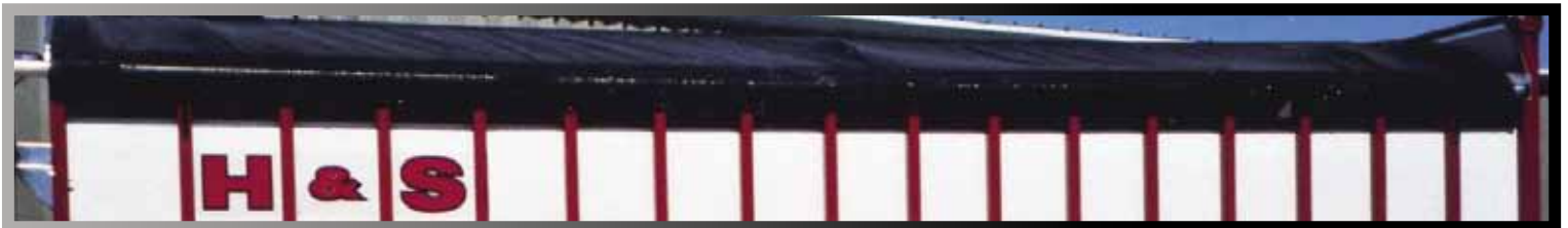
Shown with the optional heavy-duty side-to-side electric roll tarp.

Warranty: See operators manual for warranty details and limitations. H&S reserves the right to change its products or the description at any time without notice or obligation.