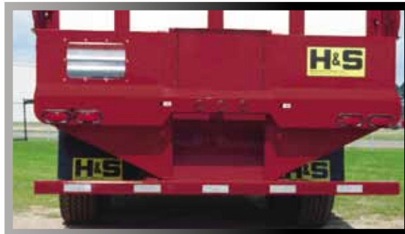
An optional grain hopper gravity unload for small grains is available for wide body boxes with a top hinged gate.