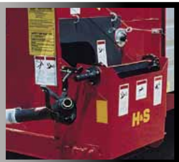
An optional 12" folding cross conveyor extension can be ordered on the HDNR 7+4.