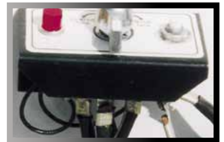
The optional front-to-rear electric roll tarp is a nice feature to keep that valuable forage from blowing out during transport.